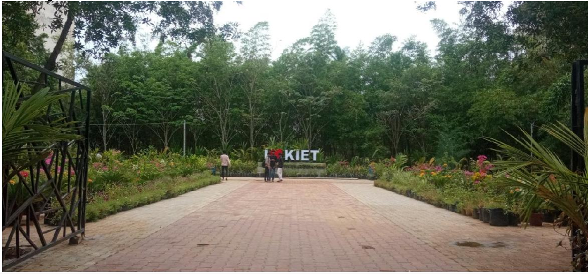
The Way towards Lift: